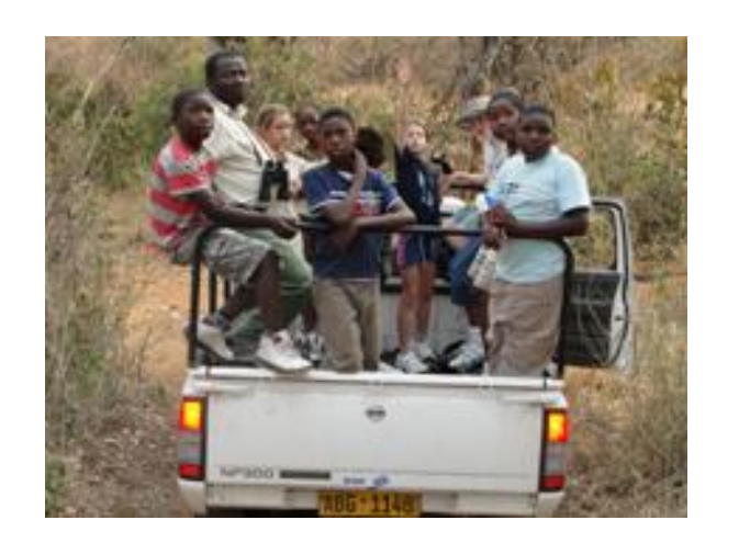
Grade Six Students in the Game Park, on a nature/ecological study

Children enjoying a hearty breakfast on the Grade Six Bush Trip, Malilangwe.